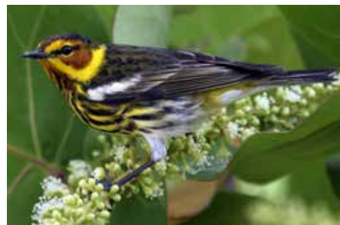
Cape May Warbler

Spring is a great time of year to go into the 'great outdoors' in our mild weather and bird!