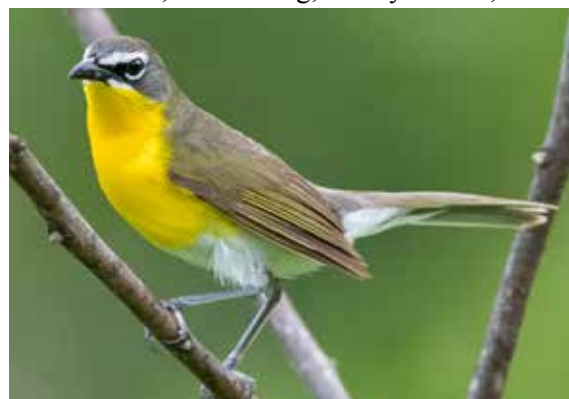
Yellow Breasted Chat

Our Spring migration has began and it's a great time to find our early arriving Summer birds as well as our departing Winter birds ... and to start looking for our transient migrants!